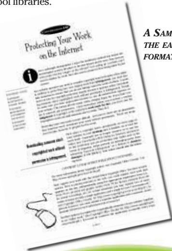
A SAMPLE PAGE OF THE EASY TO READ FORMAT.

Fully indexed, Art Law Conversations is an ideal resource for professional artists and a must for art school libraries.